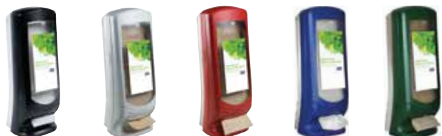
6332000 black 6334000 gray 6336000 red 6333001 blue 6339000 green

Wall Mount – The Signature stand can be easily mounted to the wall without any additional hardware. If you need to frequently remove the stand dispenser from the wall for cleaning, we offer a Quick Release Bracket . Please contact your Essity Sales Representative for more information.