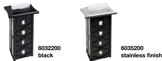
6032200 black 6035200 stainless finish