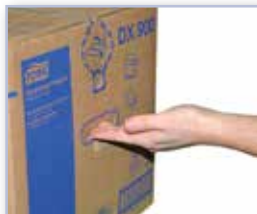
Easy to carry thanks to perforated fold-outs.

Essity offers Easy Handling packaging, a patented assortment of innovative and ergonomic solutions to ease the workload of facility staff while saving time and money. Easy Handling packaging includes the Tork Carry Box™ for our Tork Xpressnap napkins. (Easy Handling packaging not included with custom printed napkins.)