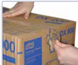
Boxes open quickly without cutting.