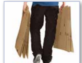
Fold box for easy disposal.