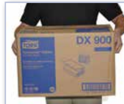
Use 2 hands for a comfortable grip.