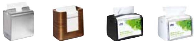
73350 aluminum 72900 walnut 6232000 black 6234000 gray