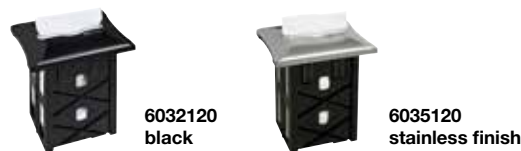
6032120 black 6035120 stainless finish